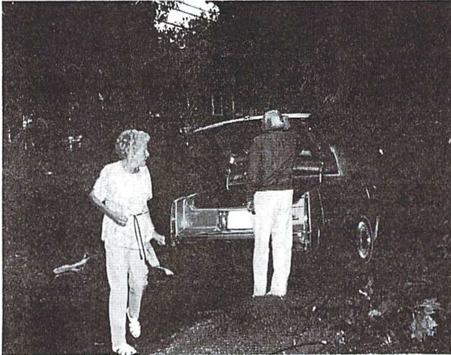
A car parked on Standish St. was hit by one of 2 large trees on Standish St.